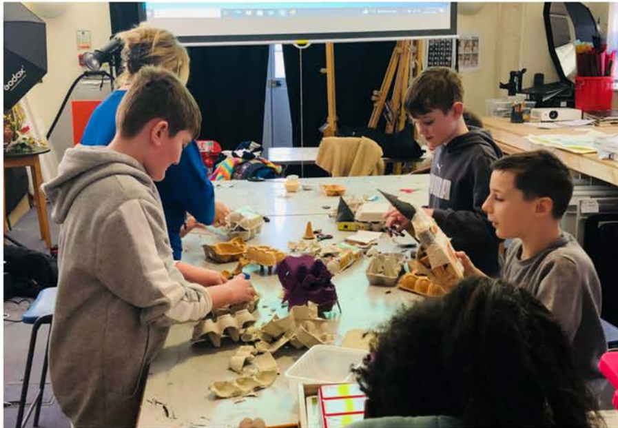
Dragonfly class in Art working hard on making Chinese New Year dragon

Year 8 English have worked so hard as a year group over the last 4 weeks, learning about Jekyll and Hyde, Victorian England and making posters with a good side and a bad side. They have just completed their first assessment on The Gothic, all of them trying their hardest and producing some excellent essays. As a department we are incredibly proud of them and as their teacher I am personally overjoyed with their progress.