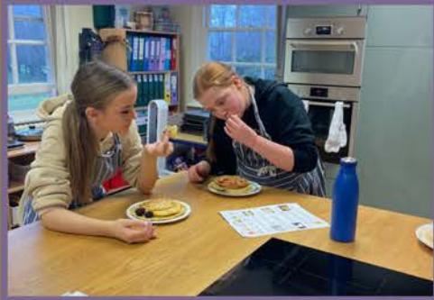
Dragonflies made 'Trench Stew' as an example of wartime meals during Evacuee Week. Year 8 made celebration pancakes for Shrove Tuesday