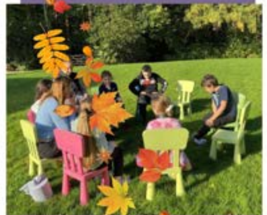
Storytelling on the lawn