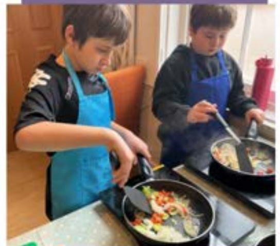
Making Vegetable Stew

Next week brings the Woodlands Voice meeting for student representatives to ask questions and raise ideas from their class about how we can make Woodlands an even better school and environment for the children. We can't wait to hear the children's suggestions!